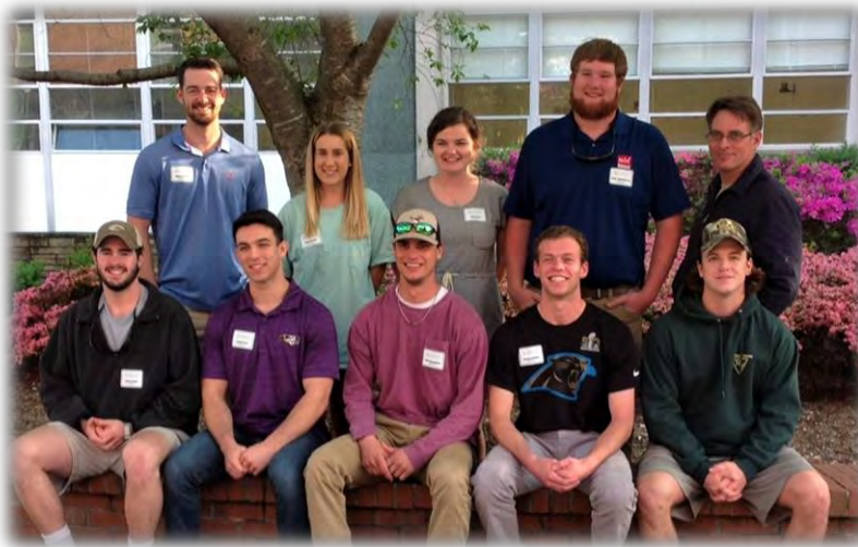
Spring 2018 Inductees