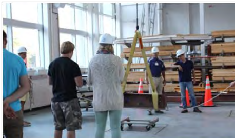
The CMGT Department hosted a "Get the Facts" event in the fall, allowing outside students to learn about the major.