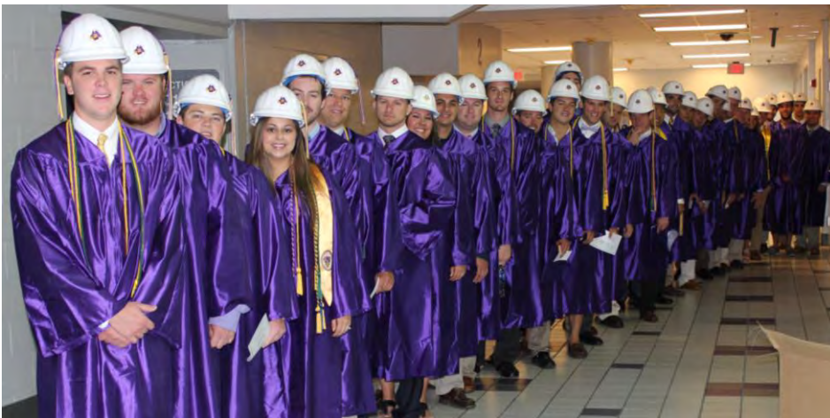
Congratulations to our Spring 2014 Construction Management Graduates!