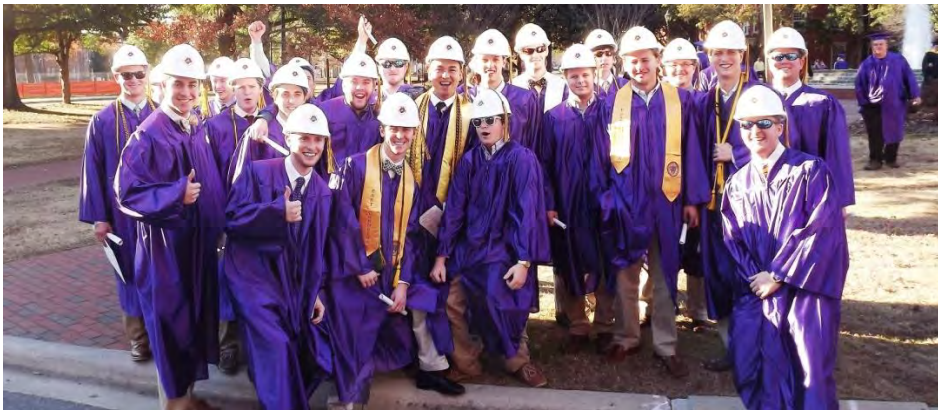
Congratulations to our Fall 2013 Construction Management Graduates!