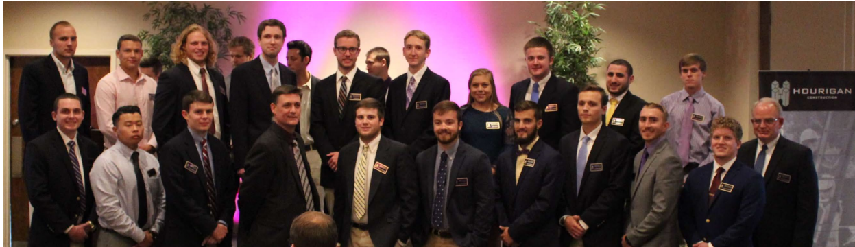
October 15, 2018 Inductees with Chapter Officers

ECU's Construction Honor Society Sigma Lambda Chi Iota II Chapter inducted 32 students during the Fall 2018 and Spring 2019 semesters. Juniors, Seniors, and Graduate Students must be in the top 20% of their respective class academically to join. The ECU Iota II Chapter formed in February 1986. Since that time 917 inductees have been recognized.