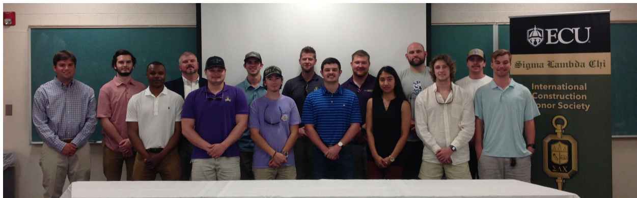
April 8, 2019 Inductees