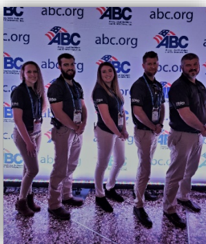
ABC Competition Team Members

The Associated Builders and Contractors (ABC) is a new student organization that was started in Spring 2018. ABC In our first year we decided to participate in the ABC National Construction Management Student Competition . There were 21 schools across the country competing. Out of the 21 entrees, 8 were picked to present while at the competition. This year's competition was hosted in Long Beach, California. The competition project was a new High School Event Center , demolition of existing pool, and installing a new pool with buildings surrounding in West Covina, California constructed by Balfour Beatty . For two months, the team worked on creating a full bid packet including estimate, schedule, project management plan, quality plan and safety plan. During this time, we met with industry members who helped us understand the process. Once in California, we were presented with step two of the competition which was adding a renovation to an existing building. We had such a great time being able to network with industry members and other construction management students. We go positive feedback from everyone we talked to. Most were impressed that we did so well as being a first-year team. The 2020 competition will be in Nashville, Tennessee. We hope to be able to have a stronger team next year now with the backing we have now.