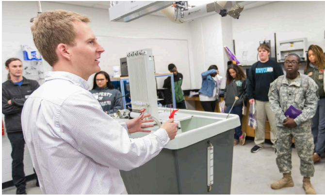
Area high school juniors recently visited ECU for the sixth annual High School Stem Day. Fifteen hands-on sessions were scheduled that represented a wide variety of education opportunities available at the University.

Nearly 300 high school juniors from across eastern North Carolina recently visited East Carolina University (ECU) to experience and learn more about Science, Technology, Engineering and Mathematics (STEM) opportunities offered at the University. ECU's College of Engineering and Technology, the Thomas Harriot College of Arts and Sciences, and the College of Education, including the STEM Center for Education, sponsored the event and provided more than 60 volunteers.