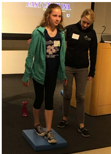
Learning more about physical therapy was one of 15 STEM-related workshops recently held at TechnoQuest on ECU's campus. (Contributed photos)

More than nine university-wide departments and programs were