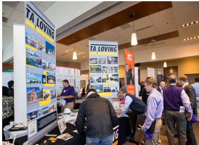
The Feb. 9 Career Networking Day broke attendance records, with more than 400 students attending and 55 companies exhibiting at the event.