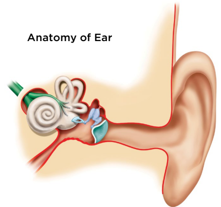
Anatomy of Ear