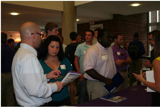
Students talk with hiring managers about internships and job possibilities at the Pharmaceutical Open House.

Representatives attending were primarily hiring managers from pharmaceutical companies including DSM (Greenville), Hospira (Rocky Mount), Metrics (Greenville), PCI