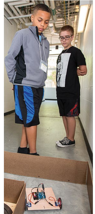
Middle schoolers at the Manufacturing and Innovation Academy at ECU watch as a robot makes its way through a maze.