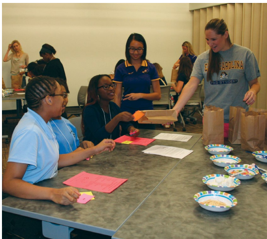
Middle school girls learn about epigenetics, or how the environment affects the way genes are expressed in individuals.