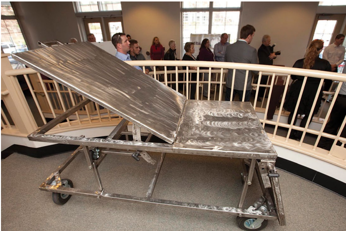
Prototype of labor and delivery bed