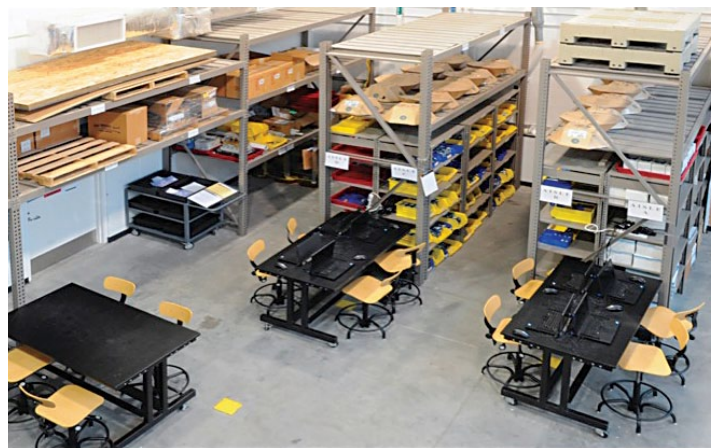
Future Old Dominion Freight Line Distribution and Logistics Laboratory

Academic Affairs in the College of Technology and Computer Science, described SAP as the software most often used at Fortune 500 companies to manage everything from human resource allocation to purchasing to the supply chain and transportation.