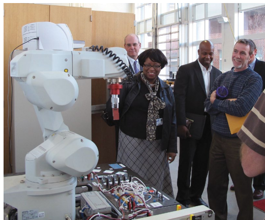
Visitors from Halifax Community College watch as a Mitsubishi robot functions in a College of Technology and Computer Science lab. The robot is used to train East Carolina University students.